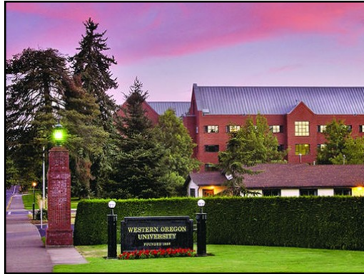
Western Oregon University Campus

On September 19, 2014 Western Oregon University's faculty and students gathered in the Werner University Center to celebrate 40 years of excellence of the well known Rehabilitation Counseling Education Master's Program. Since 1974 students participating in this program have been trained to work as rehabilitation counselors with a variety of individuals who experience deafness or other disabilities. Initially, the program began with a focus in serving Deaf individuals, but by 1990 the general rehabilitation counseling piece was